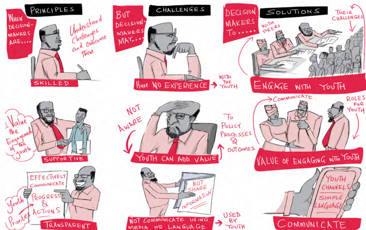
Figure 2: Meaningful Youth Engagement score-card.

Y-ACT worked with a Youth Steering Committee to identify key indicators for meaningful youth engagement (MYE) in policymaking. They worked with young designers to develop an interactive MYE scorecard (see Figure 2) to assess and engage both policymakers and young people in gaining the skills and practicing activities needed for productive and meaningful relations. To date, 59 policymakers have been trained in MYE and the tool has become a foundational mechanism for county coalitions to establish relationships with their target policymakers. In 2020, the Kenya Young Parliamentarians Association partnered with Y-ACT to launch Kenya's Youth Rising , a report tracking the state of MYE and plans for its improvement by national policymakers.